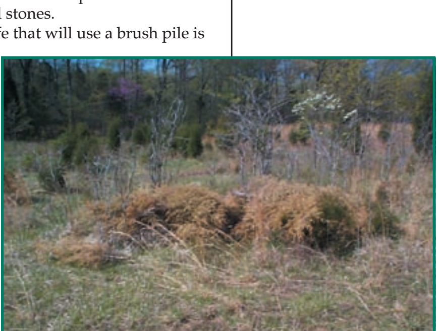
Figure 1. Brush piles provide excellent sources of cover for many species of wildlife.

determined by the type and/or size of material used in construction and the arrangement of those materials. For example, a pile of bowling-ball sized rocks would be a likely place for chipmunks or fence lizards, but the relatively small spaces between the rocks would exclude larger animals, while the careful placement of stones may provide a larger entrance and cavity.