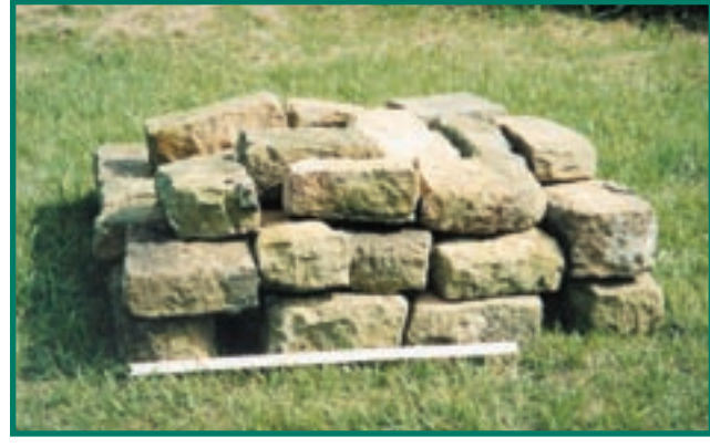
Figure 4. Exits and hollows should be constructed with the base layer of stone abd covered with two to three layers to be effective.