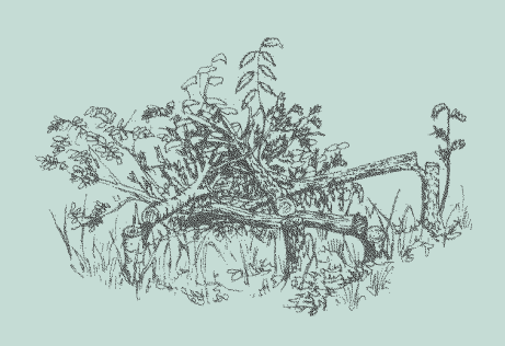
These small trees are only partially cut through and will continue to live for some time.

Cover is the portion of habitat most crucial for many Kentucky wildlife species, and brush piles create suitable cover for many kinds of wild animals. Therefore, there is no such thing as too many brush piles. The only limiting factor is your desire to build them. Be creative when choosing how, where and from what materials you make this important component of good wildlife habitat. Your main concerns should be that you like the location and appearance of it and that it provides the necessary habitat for wildlife.