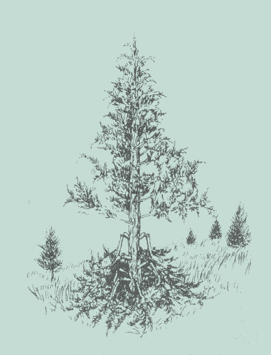
Low limbs can be broken and bent to the ground.