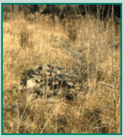
Figure 5. This rock pile makes an excellent long term brush pile which could allow management by burning.